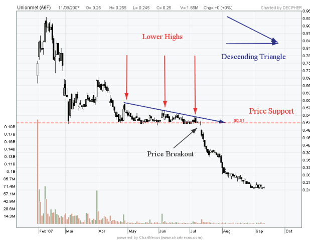
Figure 2: descending triangle example

Second in line is descending triangle. As the name suggests this price pattern is biased to the downside. Instead of a flat resistance as in the case of an ascending triangle, for a descending triangle we will be looking out for a flat support. The price will appear to have found support at a particular price and that gives investors an impression that the price seems to be holding at this level very well. Not obvious to the untrained eyes, every price rally is actually getting lower. In this case a breakout to the downside usually catches investors unaware.