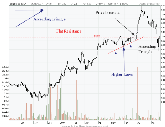
Figure 1: ascending triangle example

The ascending triangle will have a flat resistance and a series of higher lows. While the price is meeting with resistance at one particular price, it must be observed that buyers are very keen and that the dips from the resistance are at subsequent higher prices. Breakout happens when the resistance finally gives way. An ascending triangle breakout is biased to the upside and one should note where the breakout occurs. The best breakout of triangles happens away from the apex of the triangle.