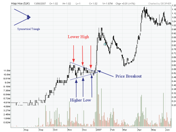
Figure 3: symmetrical triangle example

Last but not least, is the symmetrical triangle. This price pattern has an even bias for a breakout to either the upside or downside. Price will form lower highs as well as higher lows, during its convergence towards the apex of the triangle. This shows that the buyers and sellers are evenly balanced and the price then trades in a converging manner until a breakout to either side happens.